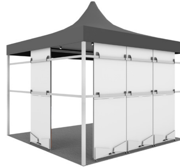
5. Crossbar holder for fixation in the event tent

All solutions on our website in the store under (QR Code): www.speedpepper.com